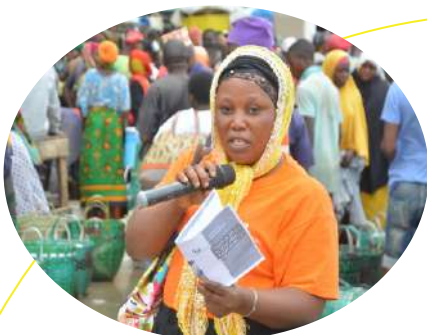
Women Leadership & Civic space