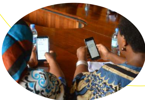
Technical support & Bridging the digital gender divide