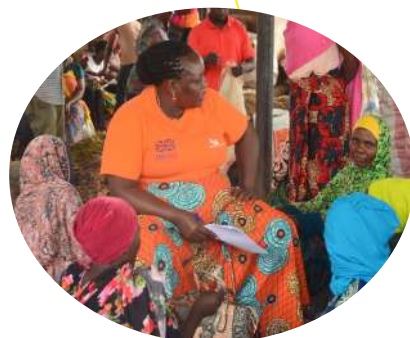
Safe public space & Access Justice