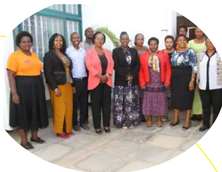
Policy reform & engagement